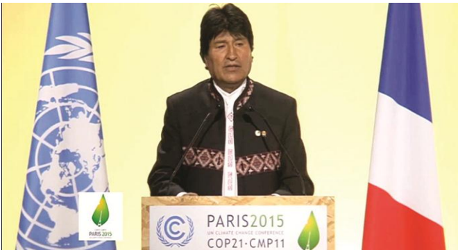
Evo Morales Ayma- President of the Plurinational State of Bolivia – COP21-Paris 2015

The Paris Agreement, which has been ratified by at least 55 countries that globally represent the 55% of the total greenhouse gas emissions, has entered into force on November 4, 2016. To this date the Paris Agreement has been ratified by 131 countries.