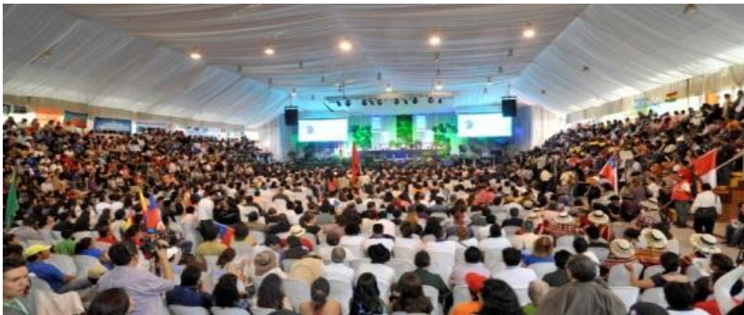
October 10, 2015, Tiquipaya, Cochabamba, Bolivia.- President Evo Morales, together with the French Minister of Foreign Affairs, Laurent Fabius, inaugurating the II World Conference of Peoples on Climate Change and Defense of Life

The Bolivian position on climate change is supported by the conclusions of the World Conference of Peoples on Climate Change and Rights of Mother Earth – Tiquipaya I (2010) and the World Peoples' Conference on Climate Change and Defense of Life – Tiquipaya II (2015), which defined a very clear line regarding the key negotiation points of Bolivia in relation to a new Climate Agreement.